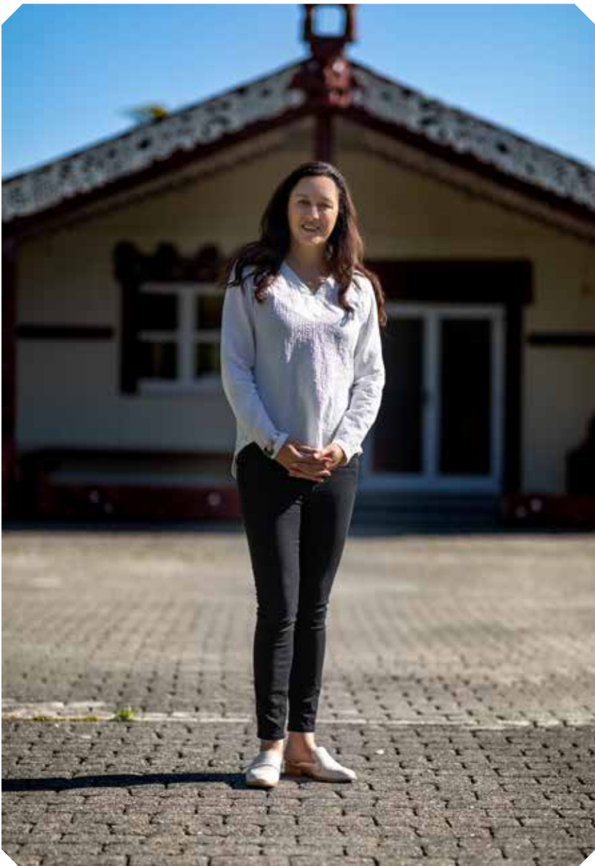
◀ Te Āwhina Marae, Motueka

How working together, with Te Taiao will make a difference